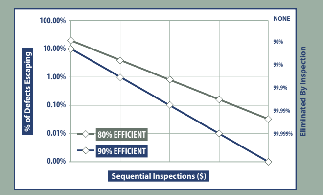
CAN WE INSPECT OUR WAY TO SIX SIGMA?

Inspection takes many forms in pharma: visual analysis, record review, audits, and walkarounds, and yet Six Sigma regards inspection as fundamentally unproductive and "non-value added." In addition to the fact a process should be improved to make inspection less prevalent, it is clear that the cost and time required to inspect and fix problems is beyond what most customers would pay, if given the choice. As the chart demonstrates, 5 or more sequential inspectors would be needed to guarantee Six Sigma performance, since the average inspection station captures only 80-90% of defects present.